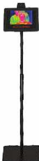
TTS-10 shown with optional APS-1 pole stand